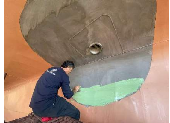
Application of first layer of Wencon coating is in progress.