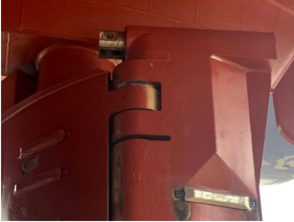
7. Rudder Flap installed - Upper Hinge