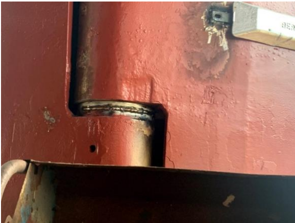
8. Rudder Blade installed – lower Hinge.