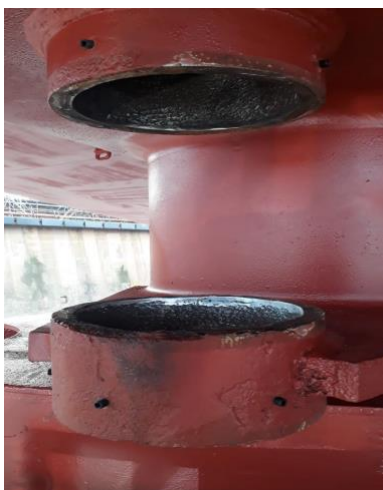
9. Upper and Lower Link Bushing housing are corroded, and Bushings became loose.

Here injecting holes drilled and threaded ready for installing bushings and inject Wencon Coating used as a casting compound.